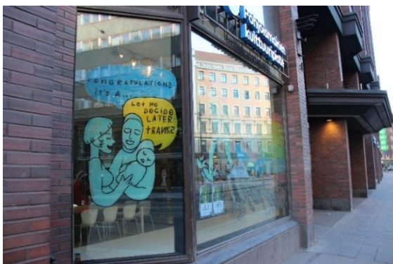
The displays windows, painted by safe house artist Shieko Reto, January 2017